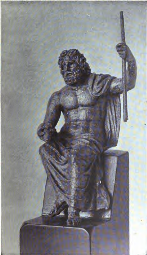
Fig. 3. Zeus.